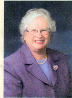
SENATOR TOBY ANN STAVISKY